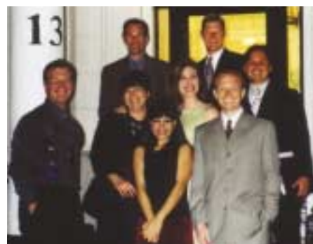
University of Texas - Houston Health Science Program participants