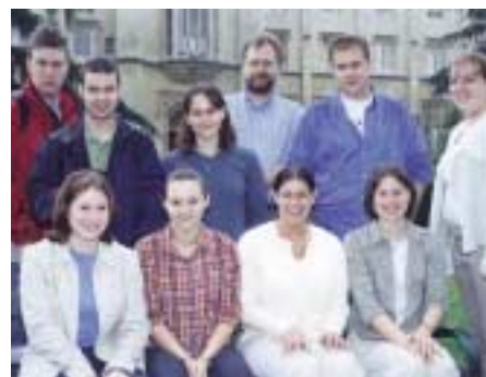
Western New England College students with their professor